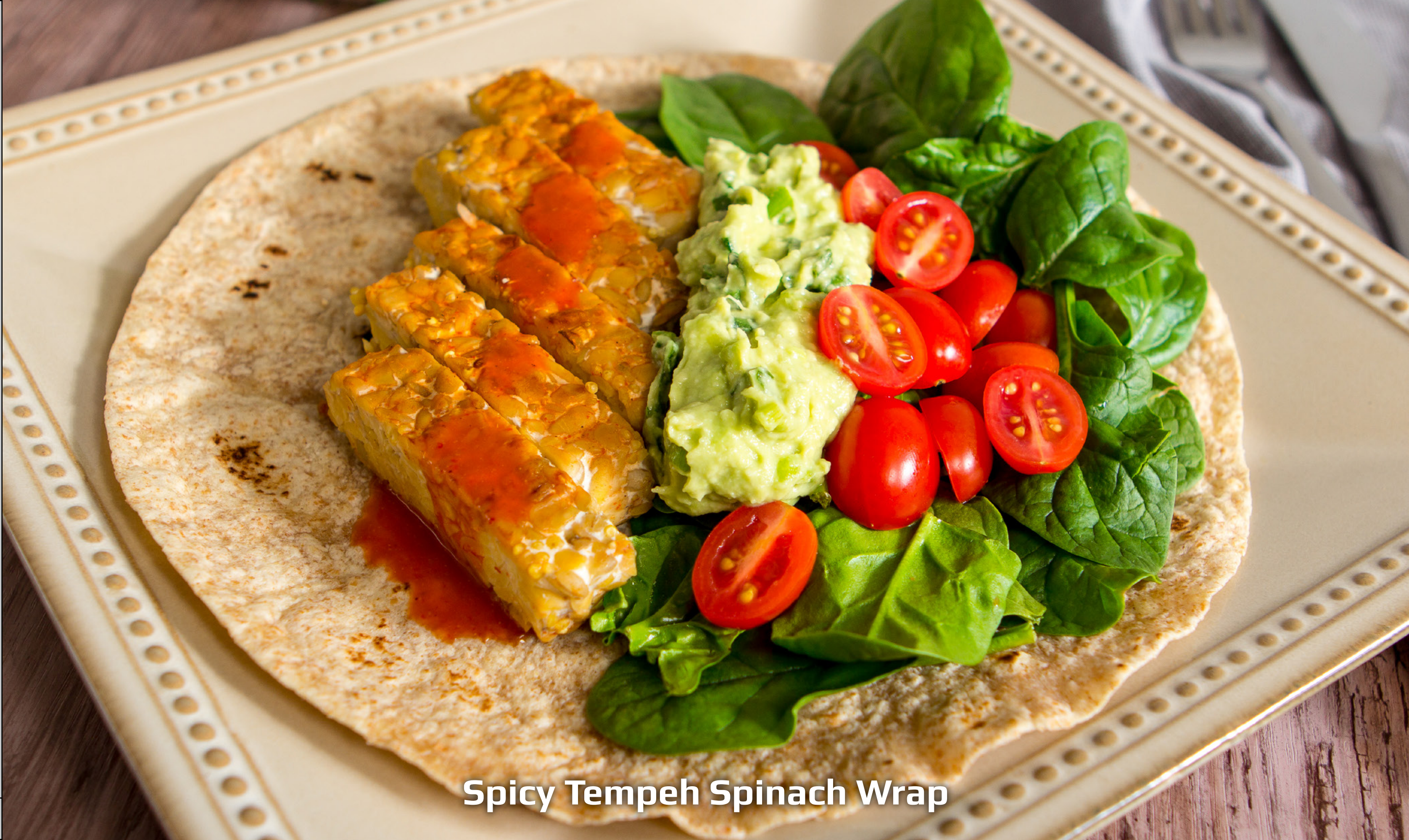
Spicy Tempeh Spinach Wrap