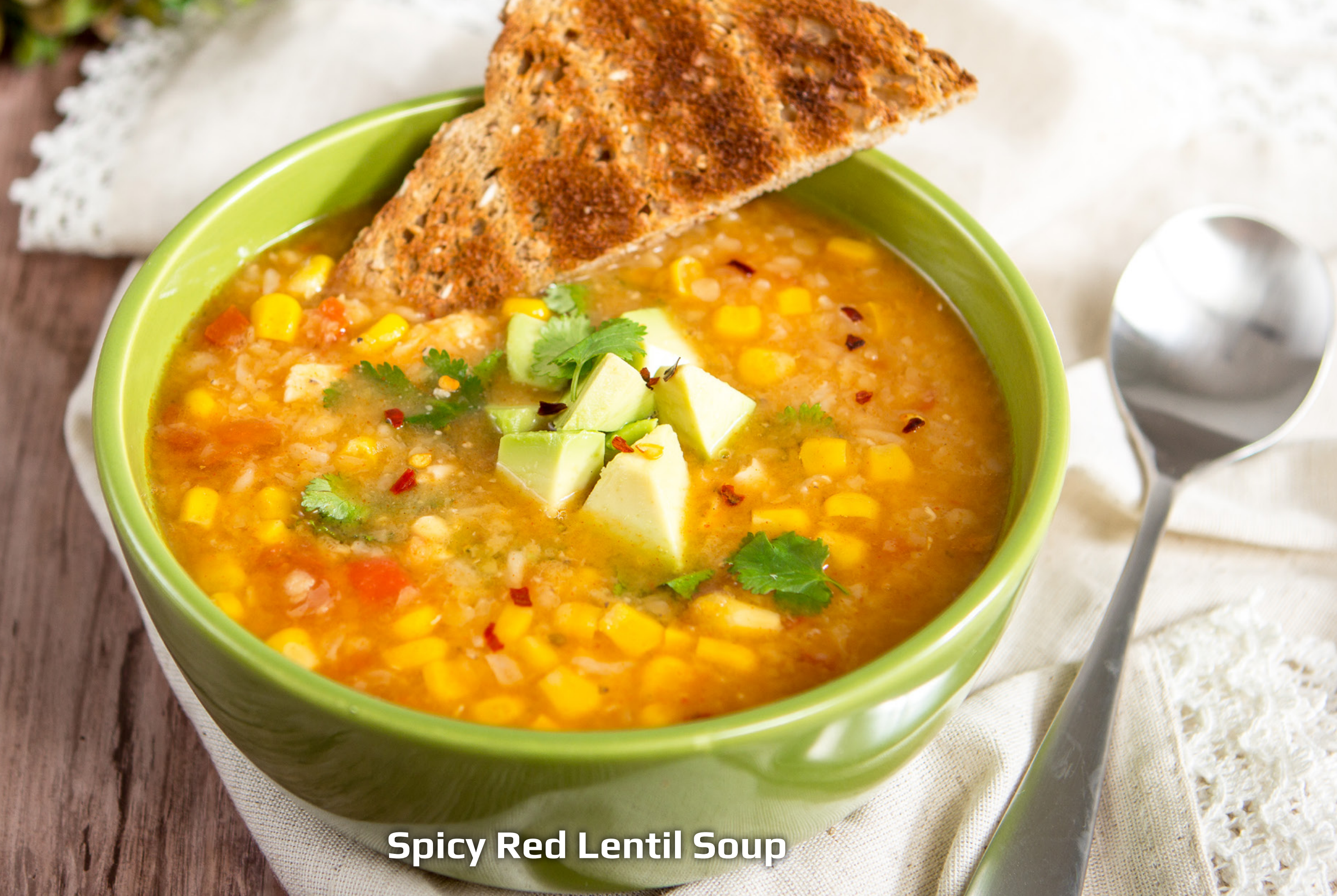
Spicy Red Lentil Soup