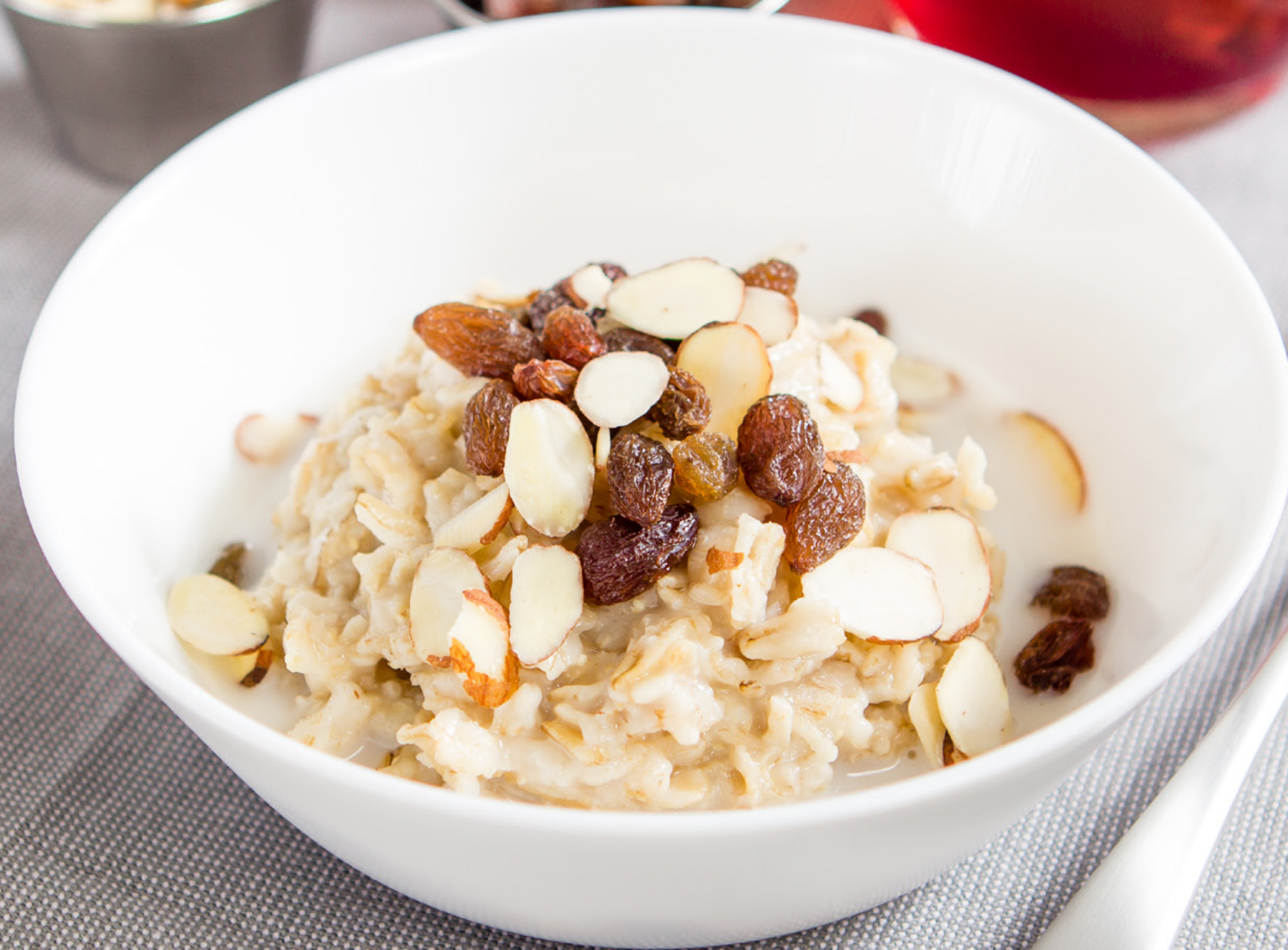
Oats & Raisins